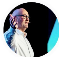
Sort Your Brain Out – LIVE!